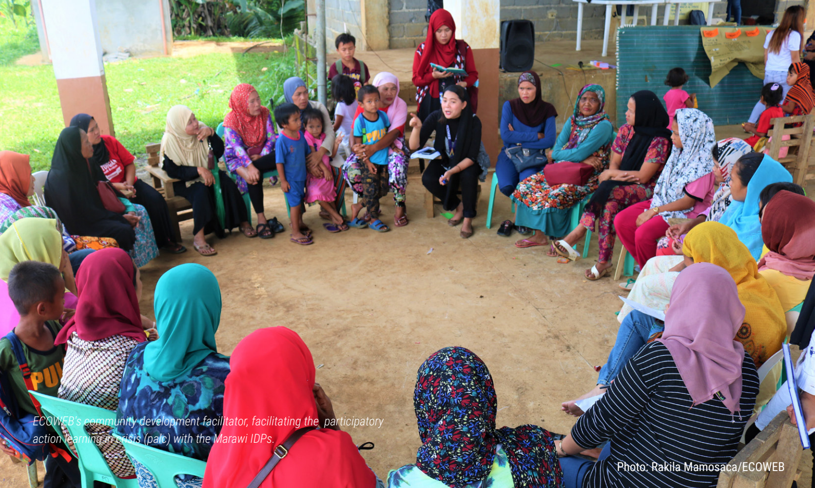
ECOWEB's community development facilitator, facilitating the participatory action learning in crisis (palc) with the Marawi IDPs.