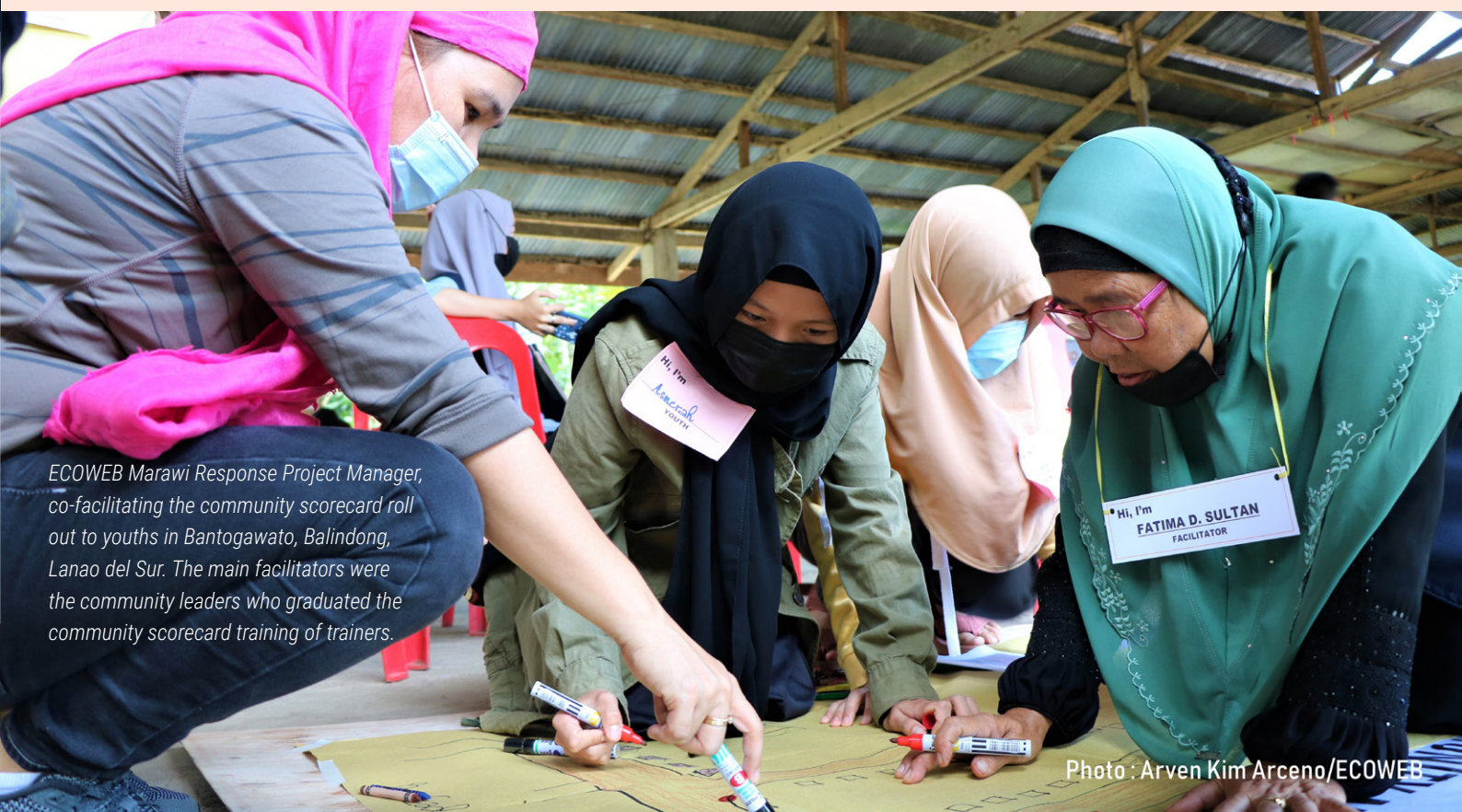
ECOWEB Marawi Response Project Manager, co-facilitating the community scorecard roll out to youths in Bantogawato, Balindong, Lanao del Sur. The main facilitators were the community leaders who graduated the community scorecard training of trainers.

5. Support nexus approach, flexible and locally led actions and more cash-programming to effectively address various humanitarian needs of communities during this pandemic.