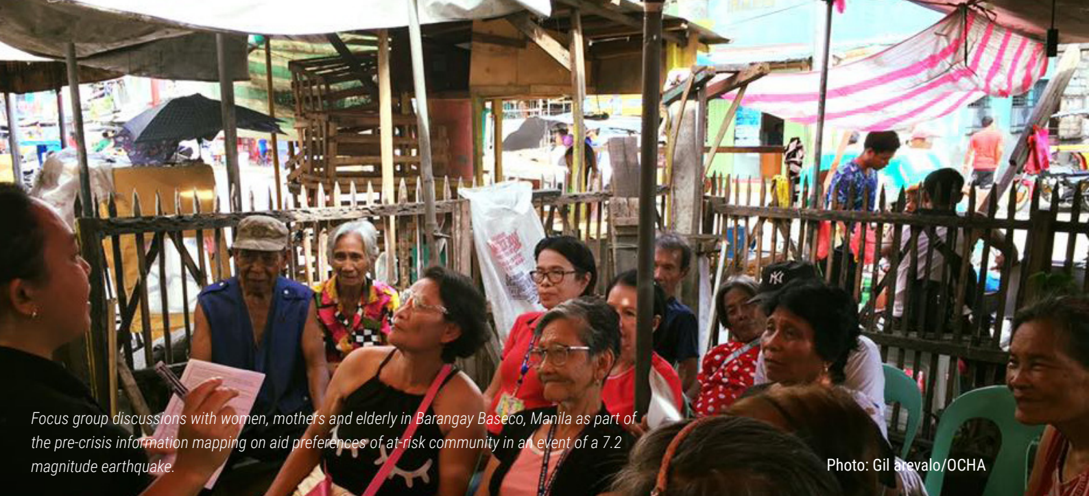
Focus group discussions with women, mothers and elderly in Barangay Baseco, Manila as part of the pre-crisis information mapping on aid preferences of at-risk community in an event of a 7.2 magnitude earthquake.