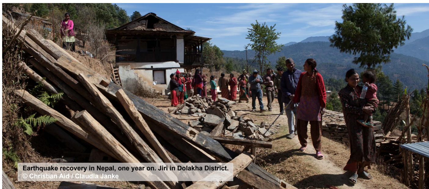
Earthquake recovery in Nepal, one year on. Jiri in Dolakha District.