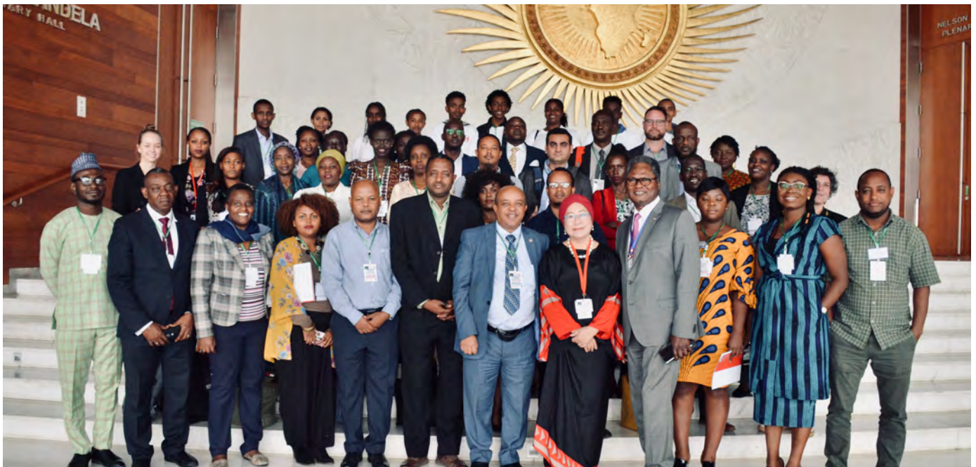
Group photo taken at the Africa Regional Conference on Localisation in Addis Ababa on 15 July 2019.

The African Humanitarian Agency (AfHA) was established in response to the expectation across the continent for the African Union to be involved in humanitarian work. AfHA will support member-states and institutional mechanisms by RECs to better deliver on humanitarian action and will backstop action by member-states as well as at the sub-regional level. The importance of localisation on AfHA's mandate was acknowledged specifically around working with and supporting the capacity strengthening of National Disaster Management Agencies as well as local NGOs and the wider civil society.