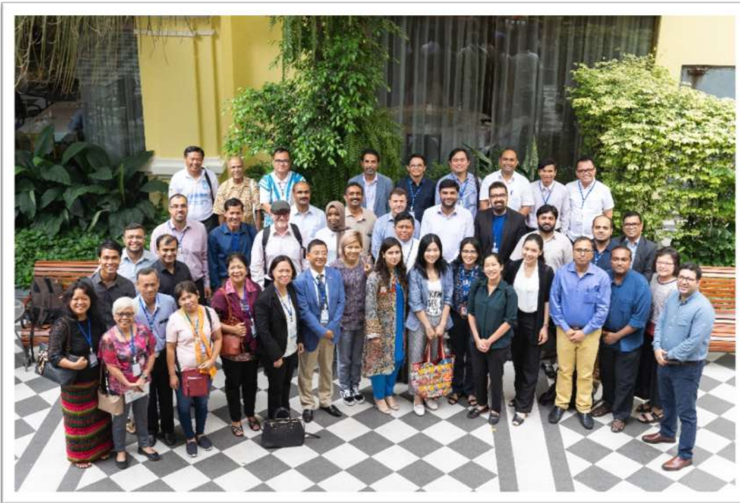
Learning event on local partnership and capacity humanitarian strengthening Thailand