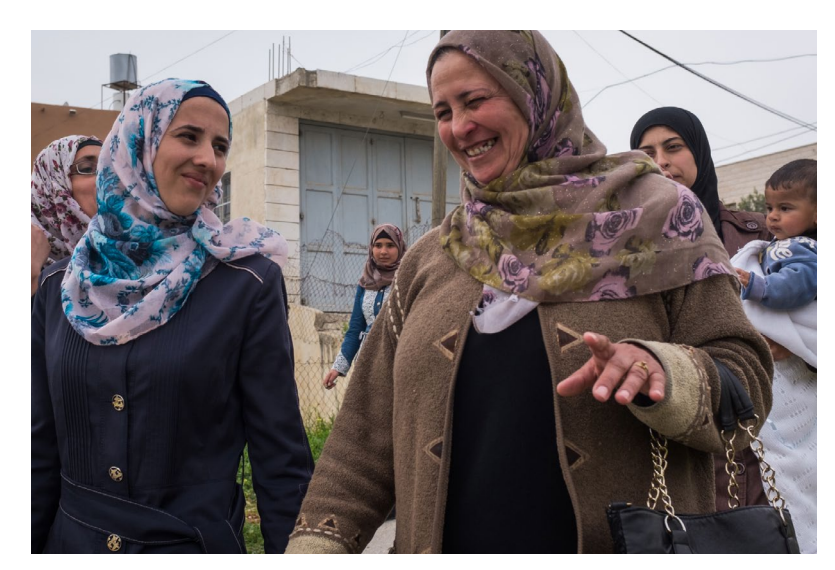
The protection groups work closely with local leaders such as the Village Councils. The groups are open for all and in most villages women have taken on a strong and often leading role in the groups.