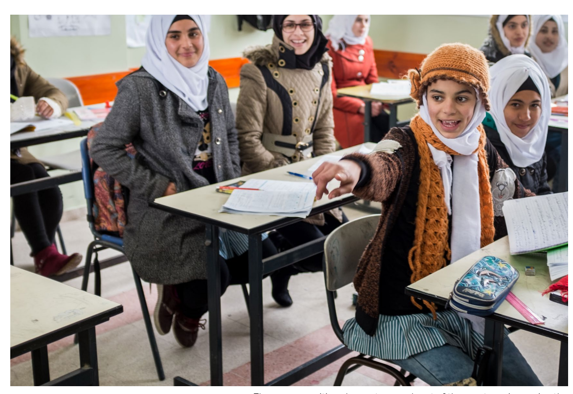
Three communities choose to spend part of the grants on improving the sanitary units in their local schools - among other to increase the number of female students who will stay on in school.