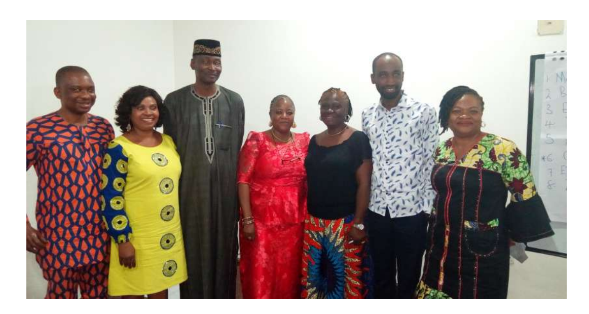
National Steering Committee members - Nigeria

Despite those challenges, the research has succeeded in presenting the views and experiences from a rich diversity of NGO voices in Nigeria, especially from local and national NGOs, whose voices are often not heard clearly enough in research conducted by INGOs. The research provides valuable insights into partnerships and beyond that can assist all humanitarian stakeholders in designing and co-creating strategies to accelerate localisation of humanitarian action.