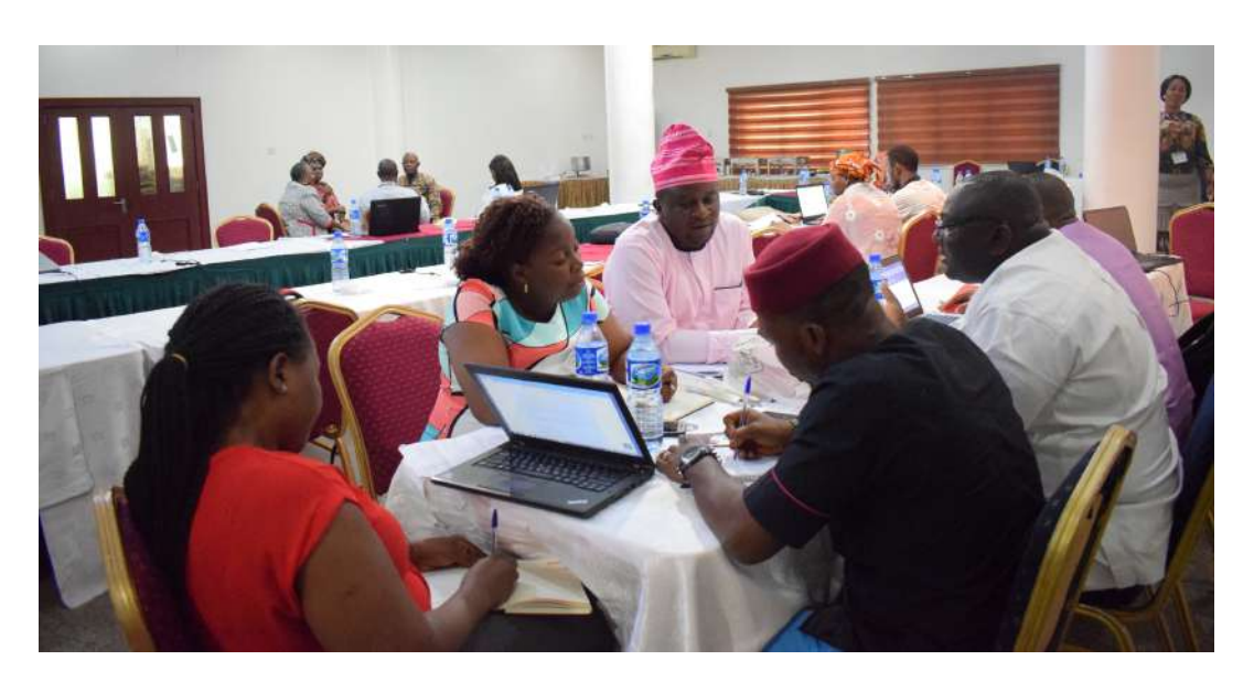
Discussing research findings and recommendations - Nigeria

The partnerships that appeared to be the most likely to support localisation are longer-term; although some good partnership practices were mentioned for short-term partnerships too. Given the protracted nature of the humanitarian crisis in Nigeria, partnerships tended to be longer than in other countries with sudden onset disasters such as floods and earthquakes, and so offered opportunities for partners to develop trust and come to common understandings.