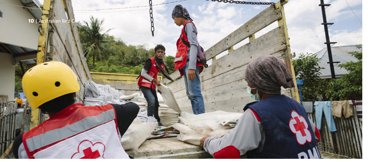
PMI volunteers delivering tarpaulins and following the Sulawesi earthquake.