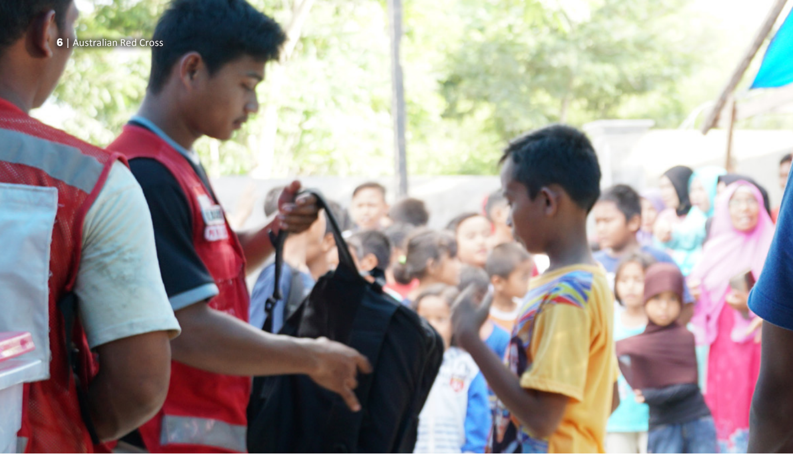
Red Cross volunteers distribute supplies to families affected by earthquake. PMI's strong volunteer network and volunteer expertise is crucial to Indonesia's emergency response.