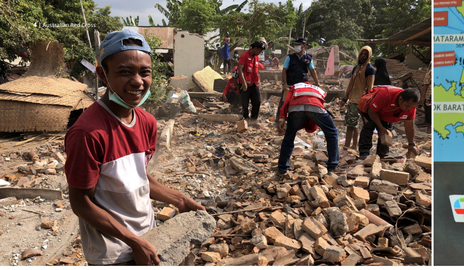
With more than 156,000 homes and properties destroyed following two earthquakes in 2018, local Red Cross volunteers were important to deliver the necessary on-the-ground work.