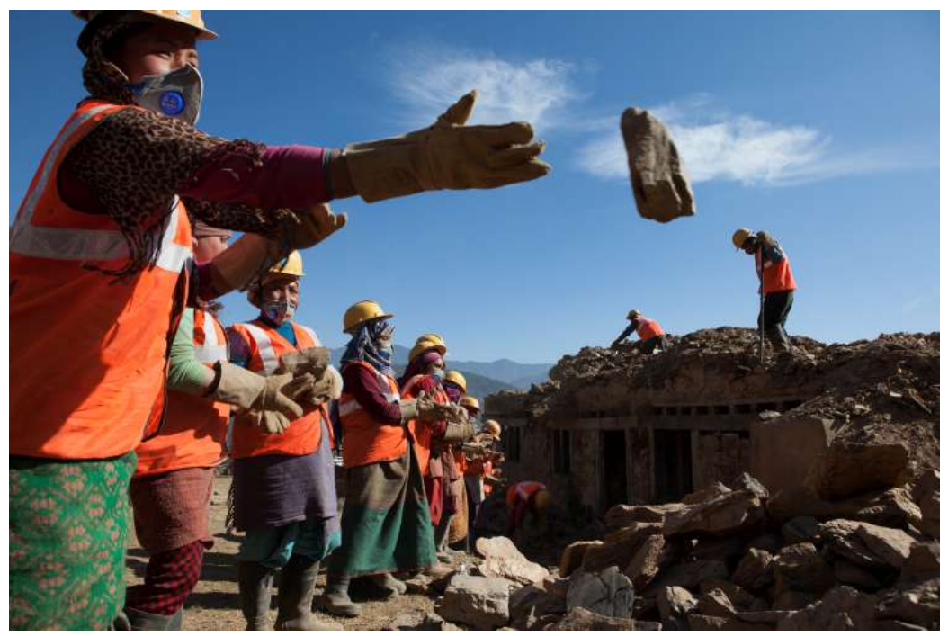
Communities come together to rebuild lives after a devastating earthquake hit Nepal.

Internationally, international agencies and networks should also use their relationships with major donors and funding agencies to encourage them to evaluate current and new funding arrangements against localisation ambitions and commitments – most notably under the Grand Bargain – while considering for themselves a new role in which they do not necessarily operate as the direct funding recipient. Ultimately, capacity strengthening, planned phase out, and hand over strategies are also vital in partnerships between INGOs and L/NNGOs which are moving towards localisation, and so a focus on this is needed.