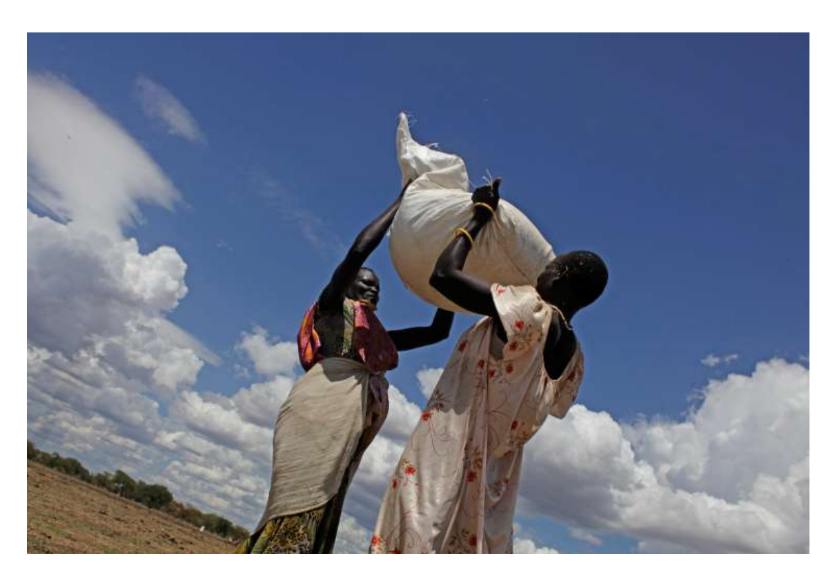
Women collect sacks of grain to give to communities who have fled from conflict in South Sudan.

Recent political changes in Nepal, designed to transfer power to local authorities, also appeared to influence participants' understanding of, and commitment to, the goal of localisation, thereby associating localisation of humanitarian action with wider governance issues.